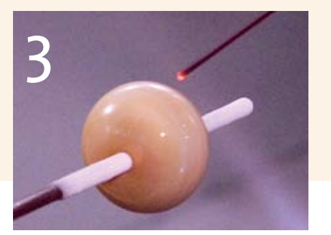
Working at the right edge of the tip of the flame.