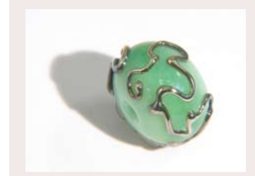
Doube Helix Triton on Effetre Opalino Nile Green