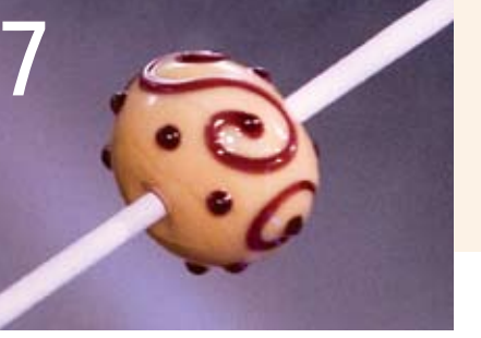
Melt in stringer decoration slightly. Let