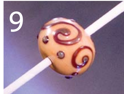
Gently reheat the bead at the tip of the reduction flame. Continue reducing by bouncing in and out of the flame until desired effect is achieved.