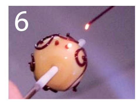
Add dots to complete design.