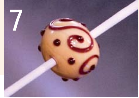
bead cool until the glow is gone.