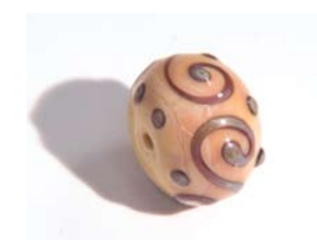
Doube Helix Psyche on Effetre Opal Yellow