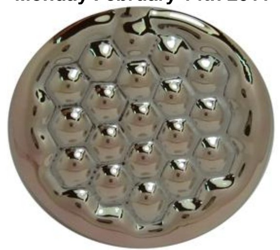
Pictured above is Helios after reduction. The texture was made with a Jim Moore hand stamp. Pictured below is Helios without reduction.