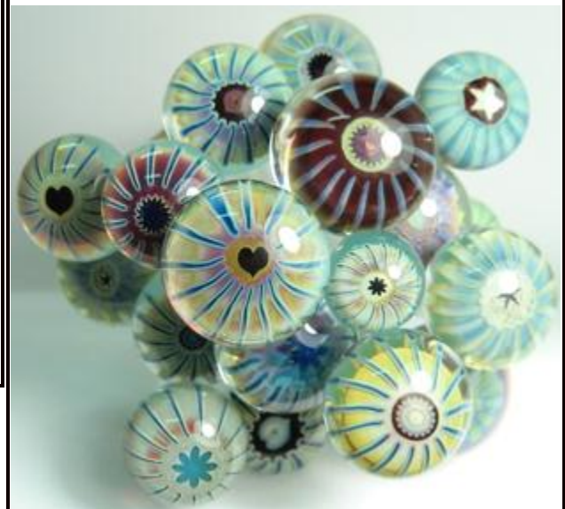
Photo above shows 5-7 mm murrini chips reduced, struck and encased in Aether.

Available in 3-5, 5-7 or 7-9 millimeters in diameter. All are cut to 50 mm in length. We tried out our new heart mold for this session! Each tin will contain one ounce of assorted murrini.